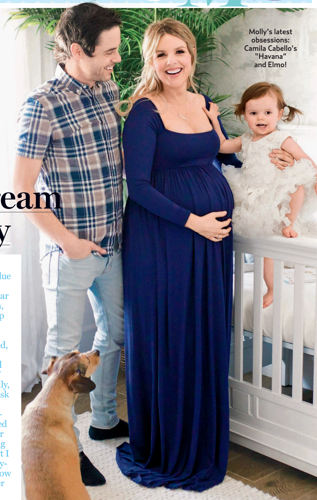
Molly's latest obsessions: Camila Cabello's "Havana" and Elmo!